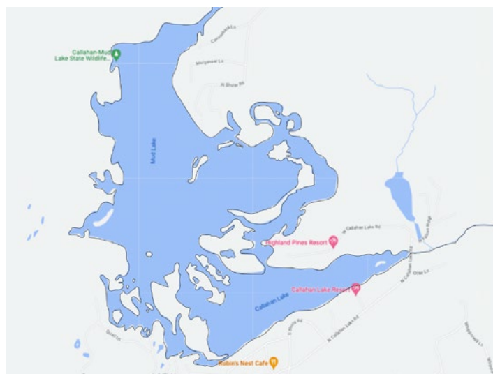
The lake today.